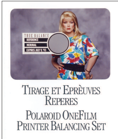
Figure 1 Polaroid Shirley card