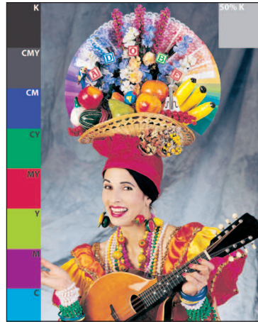
Figure 8 Adobe Illustrator's Shirley card (Printed with permission of Adobe)

and squares of digital colours, as well as the grey scale. Another colour balance image (online and in paper form), which initially came with Adobe Illustrator's Photoshop software program and is shown in Figure 8, is that of a Latin American-looking woman, conjuring up memories of Carmen Miranda 8 with a fanned headdress containing a basket of exotic fruits, playing what looks like a mandolin. She is standing in front of a grey background, beside a set of colour bars. Adobe has exoticized its Shirley's fashion look. However, though she is Latino in appearance, the skin colour of this woman is no darker than that of a typical "Caucasian" female. Thus, despite the ethnicization of the Adobe "Shirley's" facial features, the lightness of complexion attests to the reappearance and re-privileging of the "look" of Whiteness as a beauty norm in this "internationally ideal" photo.