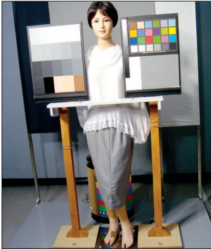
Figure 5 Fuji's mannequin Shirley

ethnic majority and the preferred skin tones in two of the dominant Japanese industries of visual representation, that of Fuji Film and Kodak, Japan. These have been widely circulating since the mid-nineties in Japan.