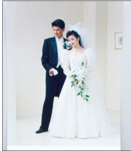
Figure 6 Kodak Japan's bride and groom card

Ongoing international skin colour preference tests conducted by Kodak have also generated much data useful in informing Kodak film chemists and “designers” of the skin colour biases preferred in different parts of the world. This information has shaped Kodak’s geography of emulsions, which conform to these preferences, rather than to considerations of exact reproduction. The industry term used for this business choice is “optimum reproduction” (Winston, 1996). For this accommodation, film inventory is batched by region and distributed in accordance with these researched preferences. Although there are no explicit signs on Kodak’s film boxes of where each target market is located geographically, the film is coded numerically to indicate countries or regions. So, for example, in 1996, several Kodak sources indicated the regional codes to be as follows: #1–U.S. & Canada; #2–Latin America, Central America, South America, and Mexico; #3–Asia Pacific, China, and Japan (often treated as a separate entity); #4–Europe, Middle East, Africa, India.