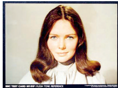
Figure 3 BBC Flesh-tone Reference Chart.

The colour-TV industry in North America also had its version of “Shirley” in the form of a white porcelain “China Girl” in use until the 1950s, at which time it was replaced by BBC cardboard flesh-tone cards especially designed for compatibility with National Television System Committee (NTSC) and Phase Alternating Line (PAL) broadcast technologies ( http://www.videointerchange.com/color_correction1.htm ). The official name for this flesh-tone reference card is BBC Chart 61P. It is used in conjunction with a chip chart in all NTSC broadcasting networks. For PAL-based technologies, BBC Test Card F is used in over 30 nations around the globe. It pictures the daughter of its designer, George Hersee of the BBC. 2 This girl-image does not differ much in the lightness of complexion or ethnic appearance 3 from the other Shirley cards in circulation at photo labs at the time of its release.