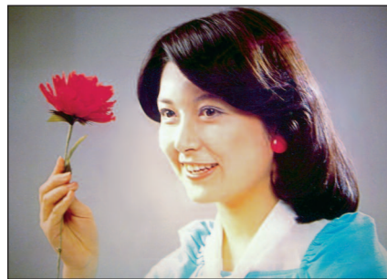
Figure 11 Japanese television reference image.